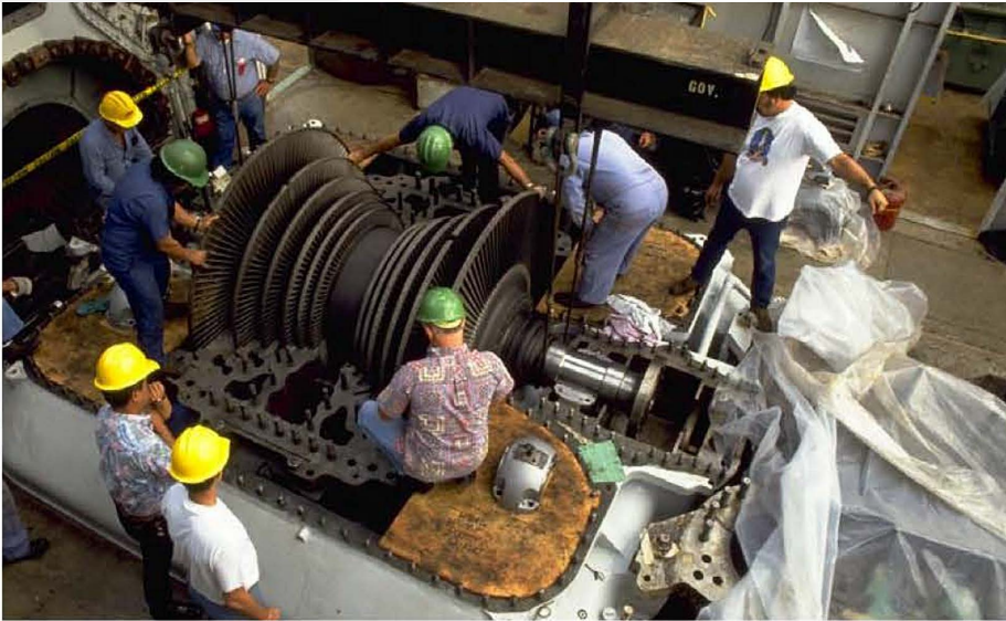
Turbine overhaul, Kahe Power Plant